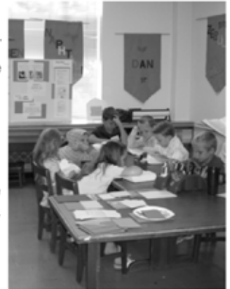
Preschool/Kindergarten Church School Class