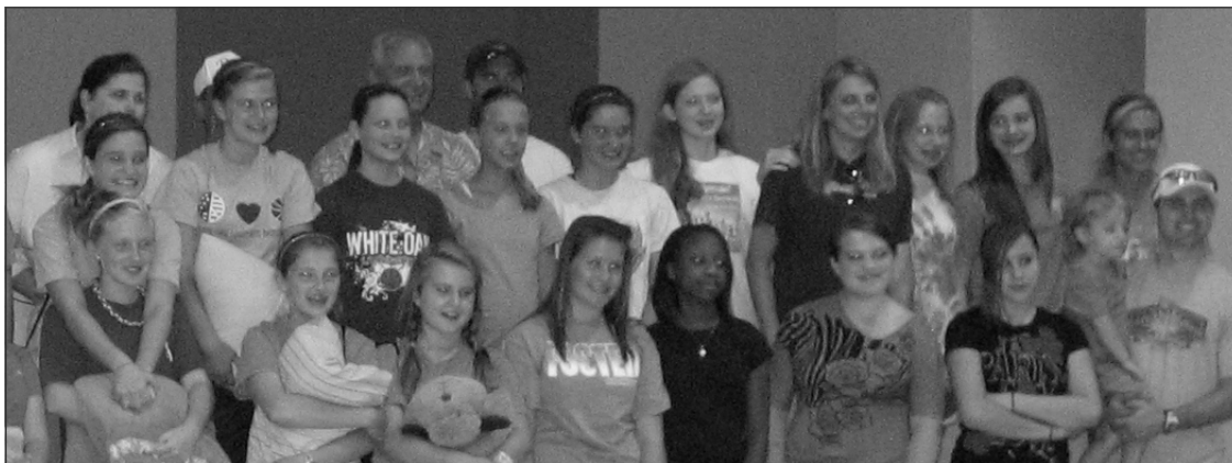
Photos at left are the Junior High mission trip participants