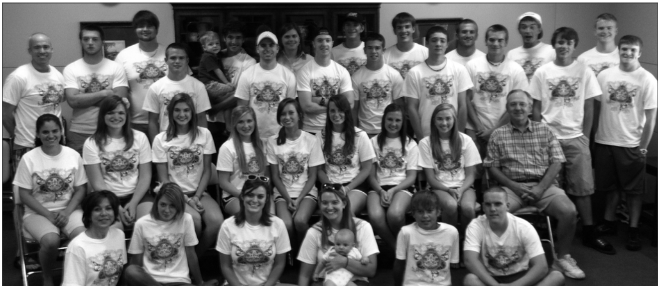
(Recent Senior High Mission Trip Participants shown above—More photos on page 5!)

*Disclaimer: The movie list is subject to change!