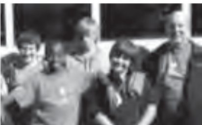
Youthquake attendees 11/12-14