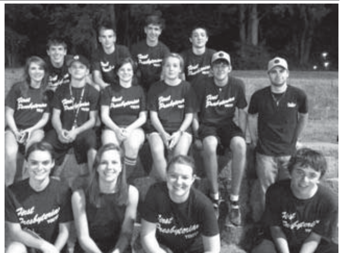
Church Youth Softball Team

Commissioning for all the above will take place on Sunday, June 20 during the 8:30 worship service