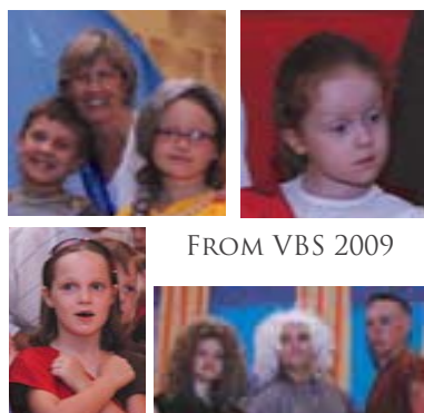
FROM VBS 2009